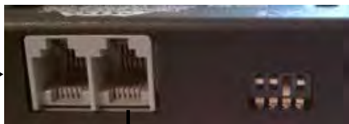
"Slave 2" RGB Controller