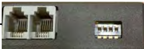
"Slave 1" RGB Controller